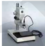
Optional measurement stand LW-990

[McWAVE is the registered trademark of CEC Co. Excel is a trademark and registered trademark of the Microsoft Corporation in the USA and other countries.]